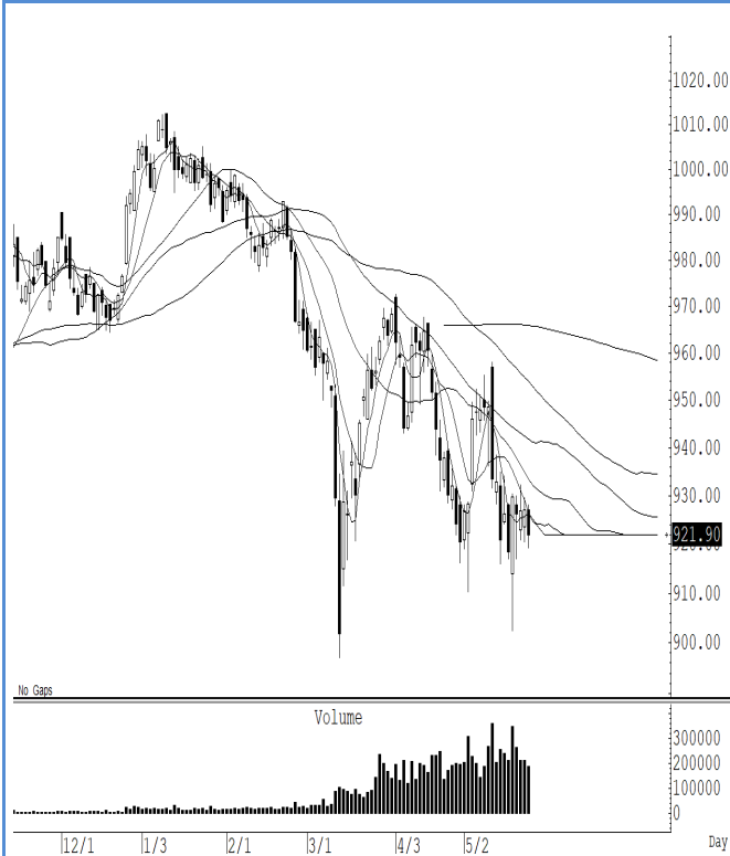
S50M23 (Close 921.90 Chg -5.20)

แกว่งแคบก็จริง แต่ค่อย ๆ ทำจุดต่ำลงไปเรื่อย ๆ แบบนี้ถ้าไม่รีบขึ้นก็เตรียมถอยได้เลย สั้น ๆ ดึงกลับไม่ข้ามแถว ๆ 925 จุด แนะนำ trading ในกรอบระหว่าง 925-910 จุด รับรู้กำไร